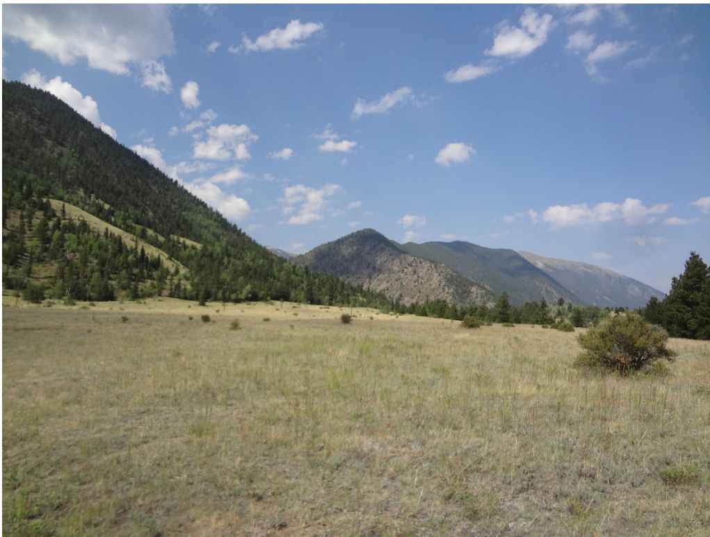
View of the site near the middle of the site looking west