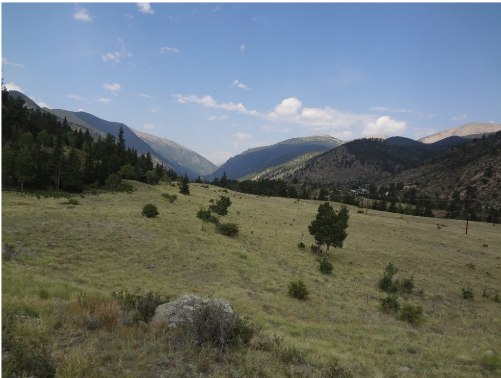
View of site from the southeast corner looking west