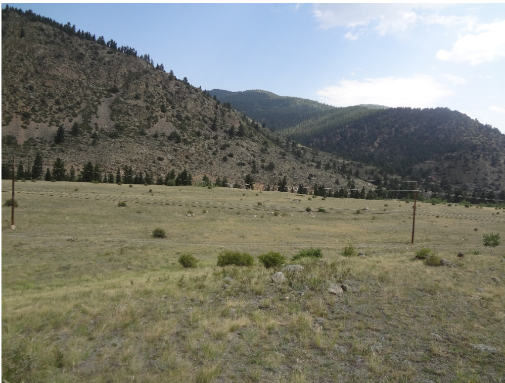
View of site from the southeast corner looking northeast