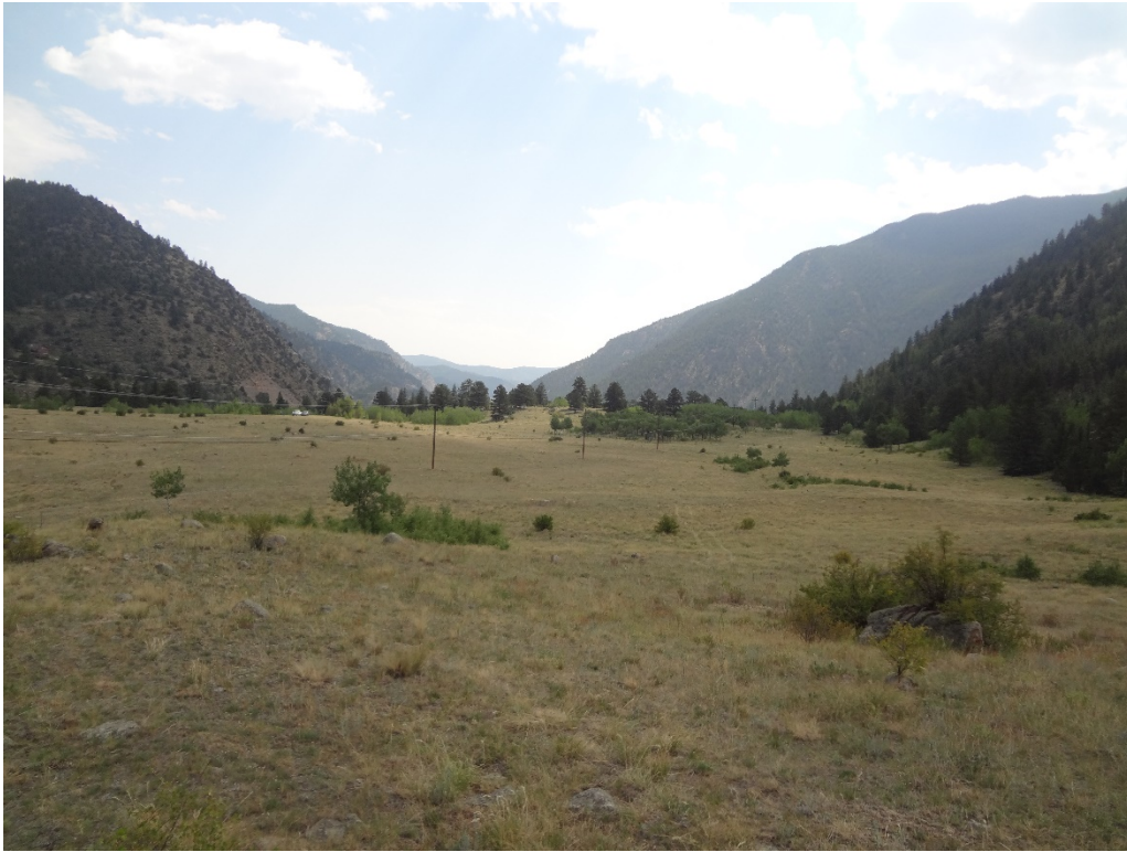
View of site from the southeast corner looking east

Mr. Ben Langenfeld Greg Lewicki and Associates 3375 W. Powers Circle Littleton, CO 80123