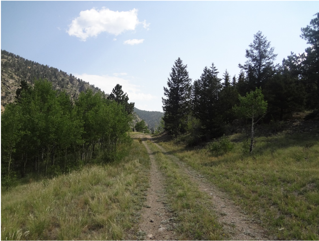
View of site from the west gate looking east