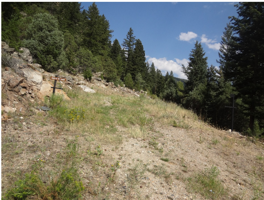
Access road from CR 257 looking west