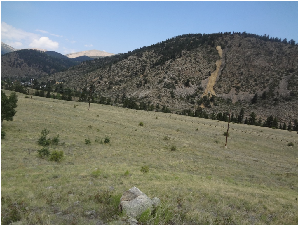
View of site from the southeast corner looking northwest