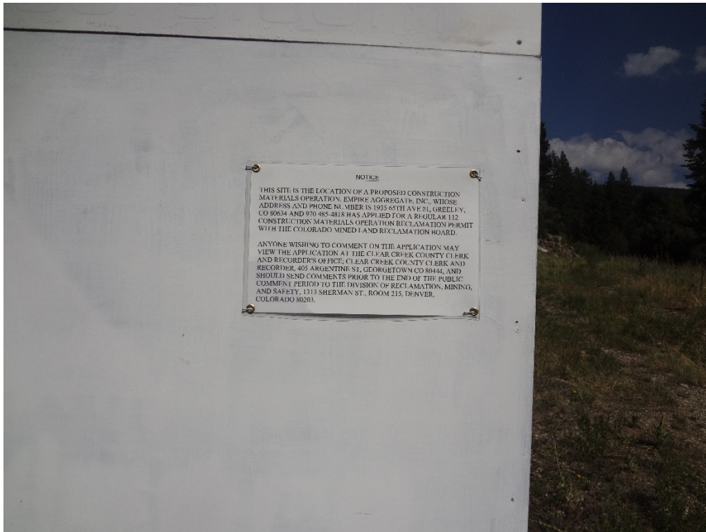
Douglas Mountain Mine notice sign