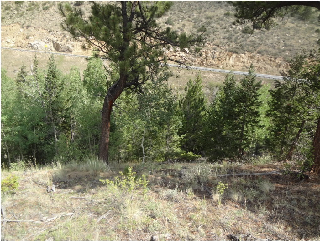
View towards the West Fork of Clear Creek from northeast corner of the site looking north