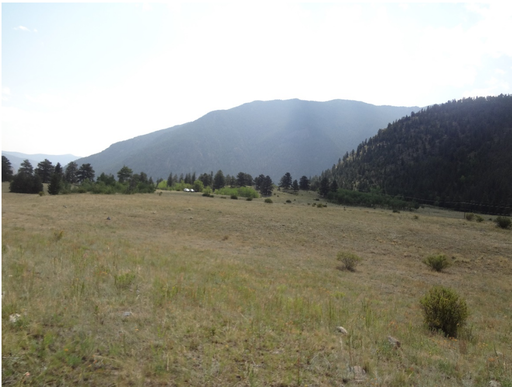
View of the site near the middle of the site looking east