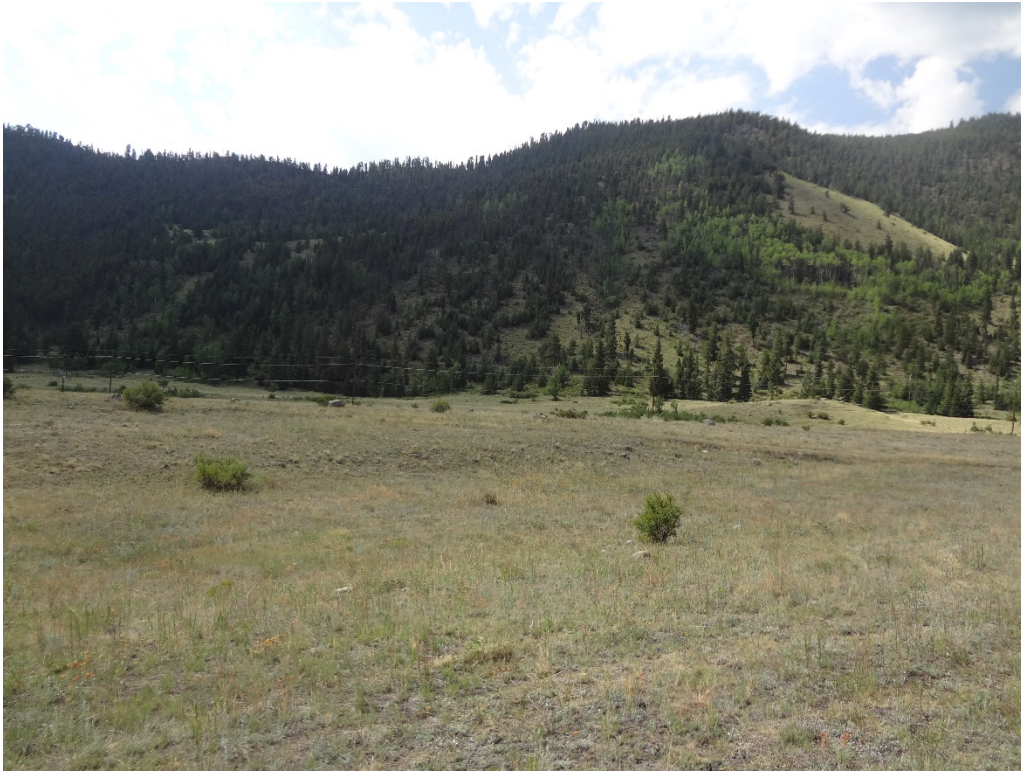
View of the site near the middle of the site looking south